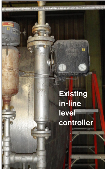
Existing in-line level controller