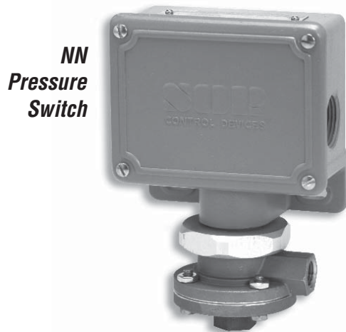
NN Pressure Switch

NOTE: If you suspect that a product is defective, contact the factory or the SOR® Representative in your area for a return authorization number (RMA). This product should only be installed by trained and competent personnel.