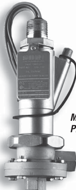
Mini-Hermet Pressure Switch

Design and specifications are subject to change without notice.