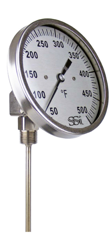
Standard Delivery 7-10 Days

The Smart Sensor (SSi) Bimetal Thermometers are reliable and accurate temperature sensors requiring no electricity or wiring. Adjustable angle thermometers allow for easy temperature monitoring from any position and they are ideal for local indication. They can be recalibrated with a turn of the calibration screw on the back of the dial. A variety of options are available for your specific process needs.